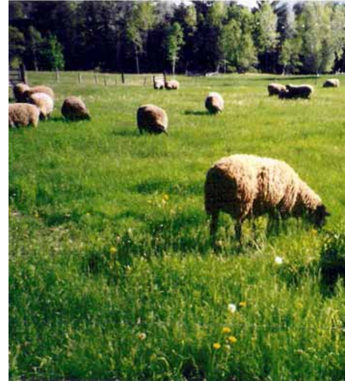
Photo of Mt. Ascutney View Farm